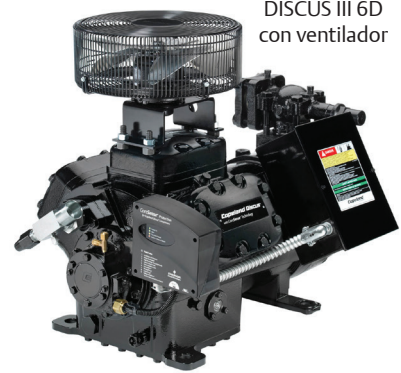
DISCUS III 6D con ventilador