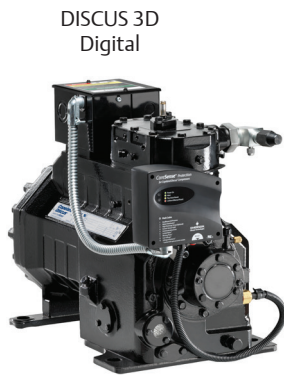
DISCUS 3D Digital